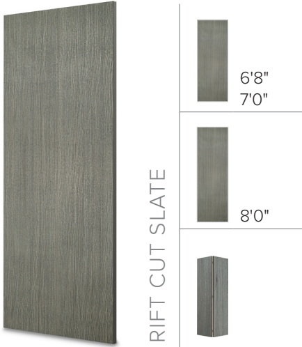
RIFT CUT SLATE

*Special Order Rift Cut finish. Please contact your Lynden Door representative for more information.