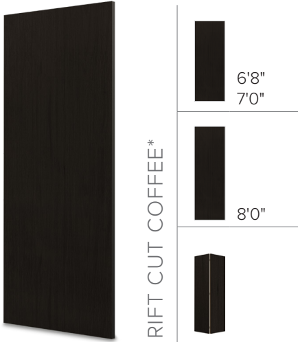
RIFT CUT COFFEE*