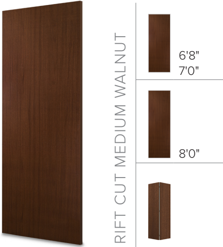
RIFT CUT MEDIUM WALNUT